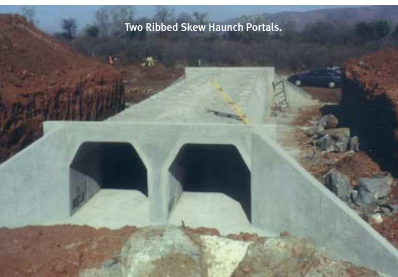
Two Ribbed Skew Haunch Portals.

Please note: Mass per metre is an approximation only. Rocla cannot guarantee the exact mass as listed on this table.